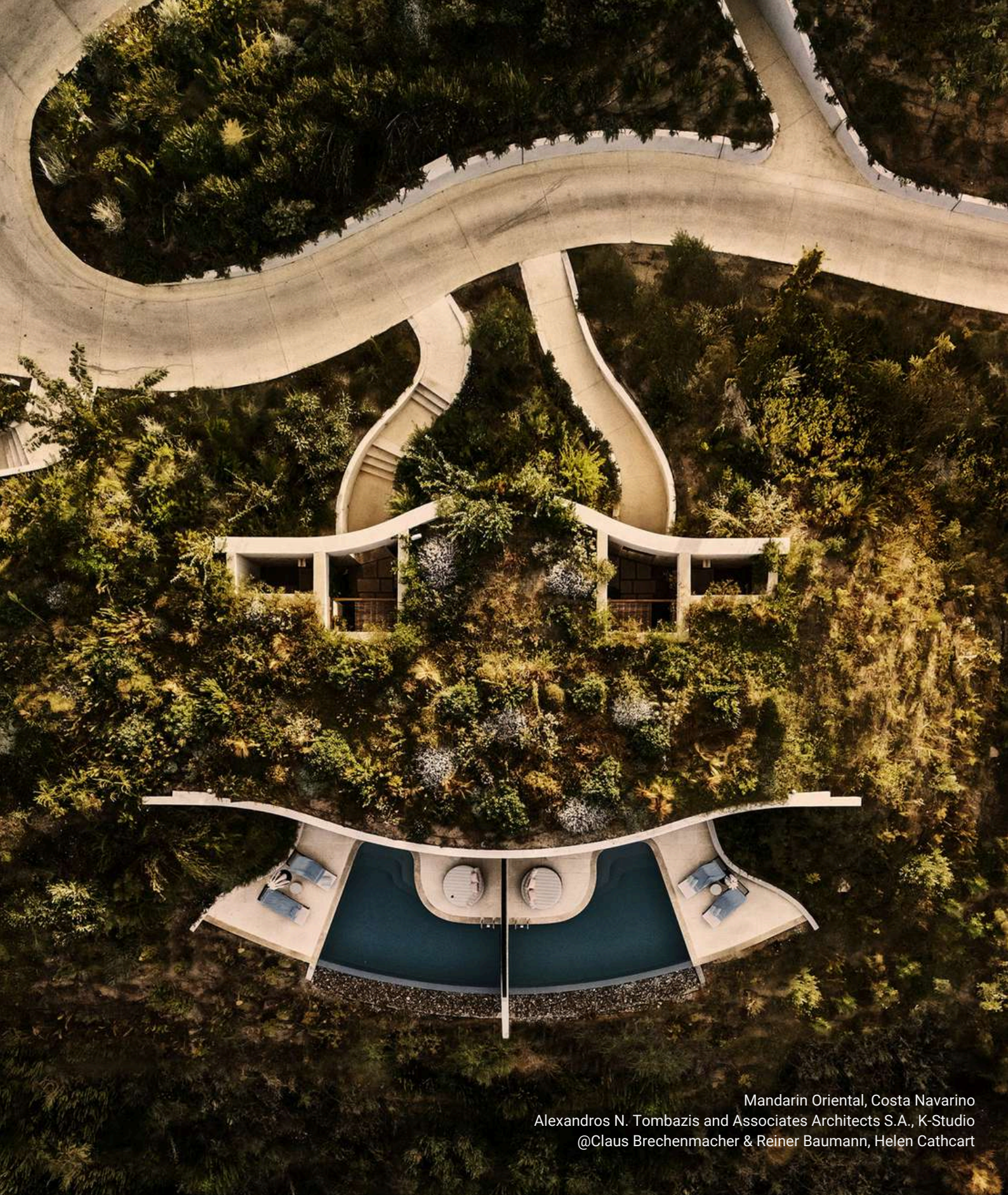
Mandarin Oriental, Costa Navarino Alexandros N. Tombazis and Associates Architects S.A.